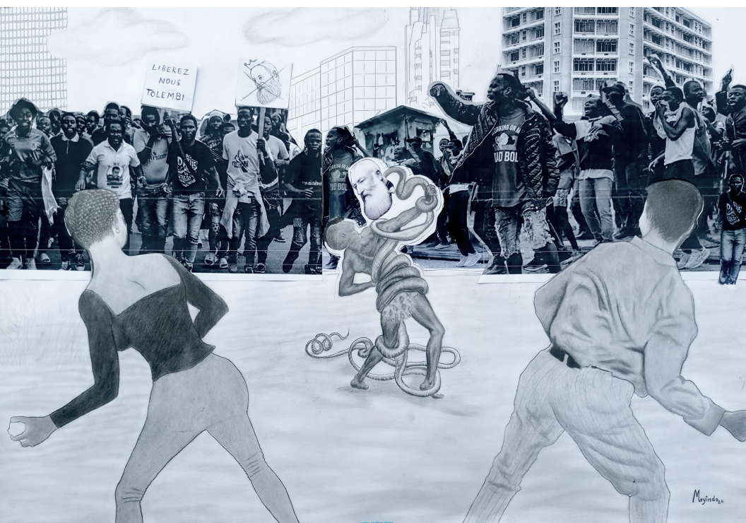
Jardy Ndombasi (DRC), Soulèvement populaire et souveraineté ('Popular Uprising and Sovereignty'), 70x100cm, mixed media, 2024.